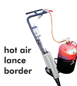
hot air lance border