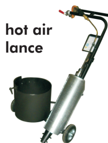
hot air lance